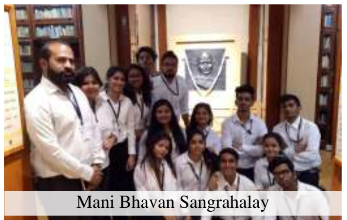
Mani Bhavan Sangrahalay