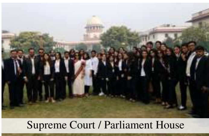
Supreme Court / Parliament House