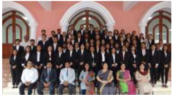
Visit to Maharashtra Judicial Academy