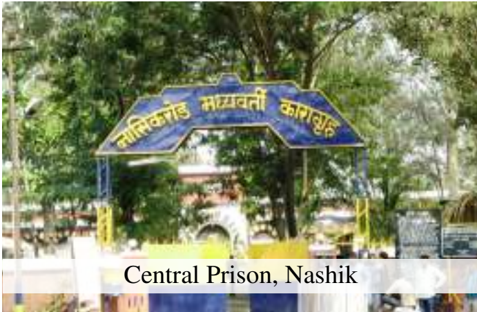
Central Prison, Nashik