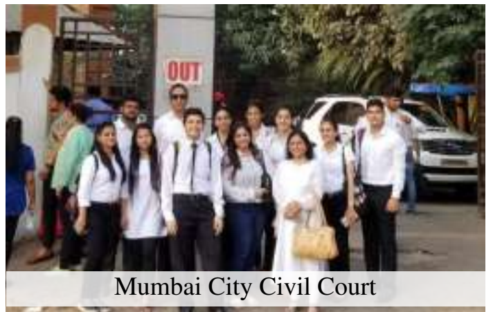
Mumbai City Civil Court