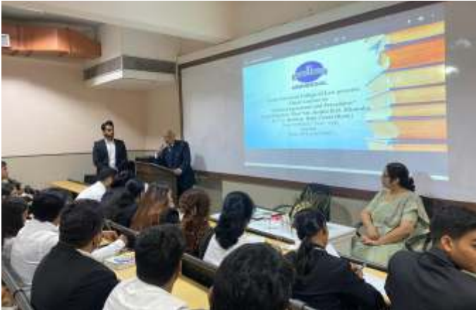
Guest Lecture On Arbitral Agreements and Procedures