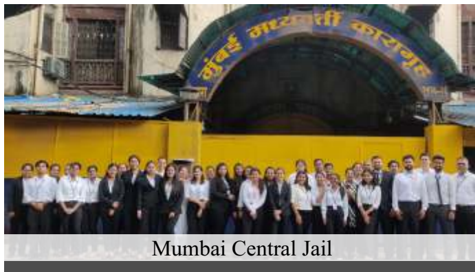
Mumbai Central Jail