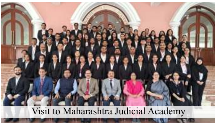
Visit to Maharashtra Judicial Academy