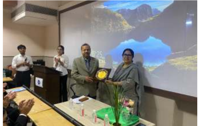
Guest Lecture on Trial Advocacy