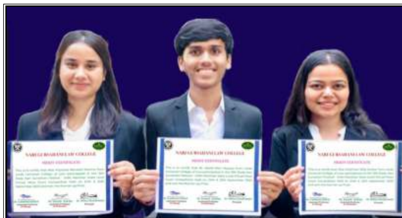
Achievement in Vidhi Manthan Moot Court Competition