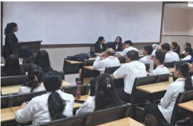
Demo Moot Court