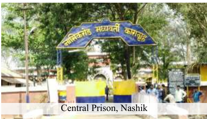
Central Prison, Nashik