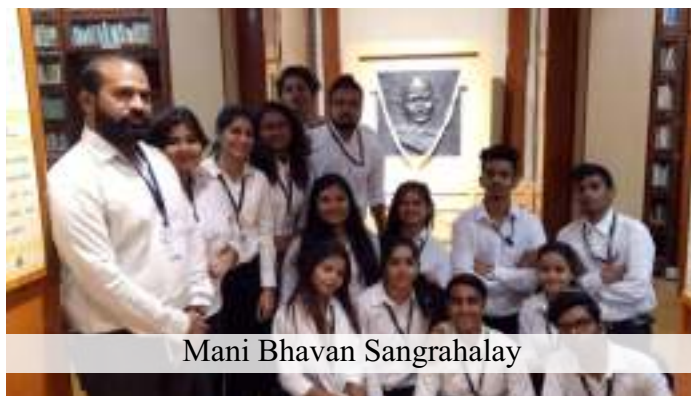
Mani Bhavan Sangrahalay