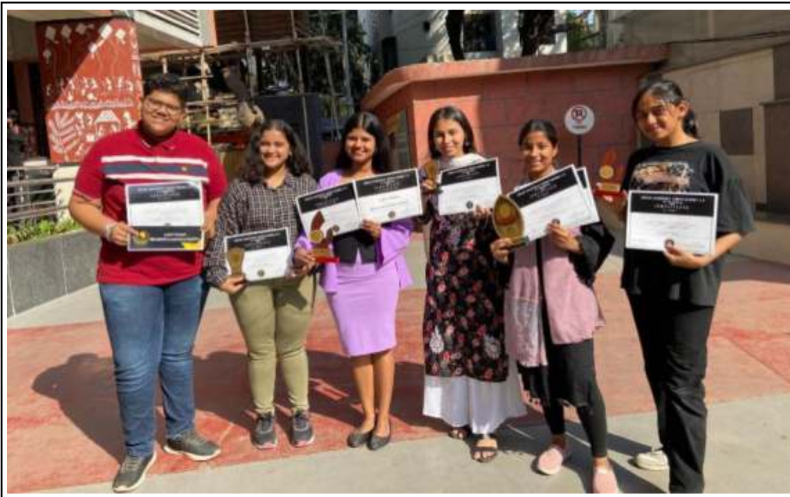
Model UN “Indian Leadership Summit” organized by Lawed Ventures in association with Lords Universal College on 17th and 18th December 2022.