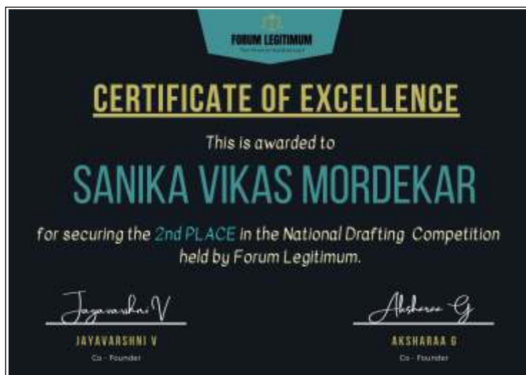
Achievement in National Drafting Competition.