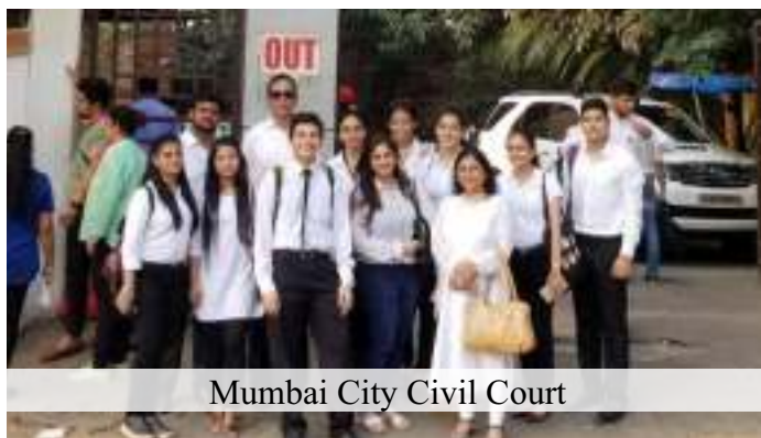
Mumbai City Civil Court