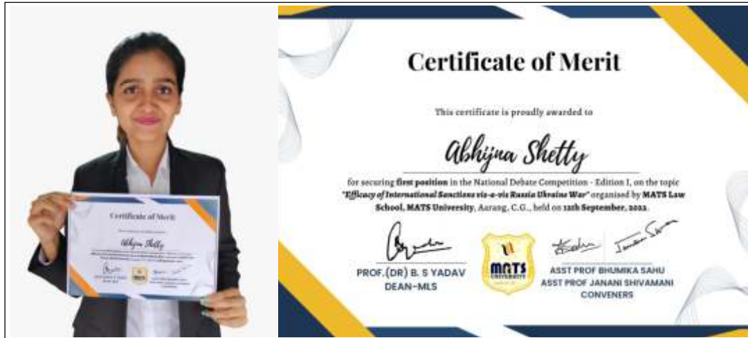
Achievement in National Debate Competition.