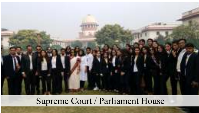
Supreme Court / Parliament House